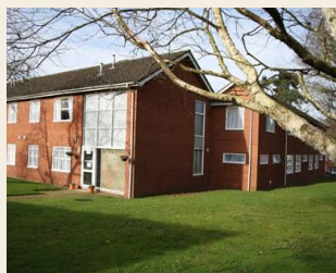
Bonner House, 172 Sellywood Road, Bournville, Birmingham, B30 1TJ