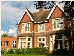
Dudley Lodge, 143 Warwick Road, Coventry, CV3 6AT